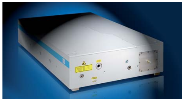
JenLas® ASAMA laser head